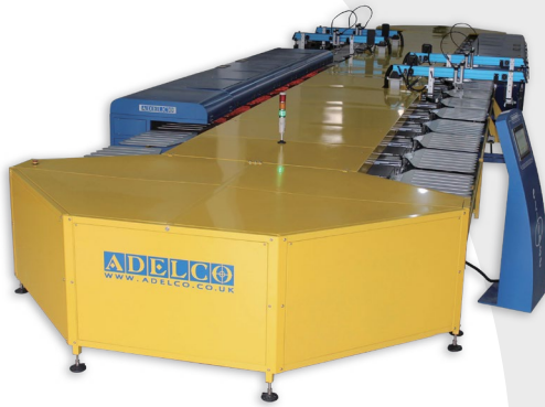
Bespoke oval design auto sock printer illustrated