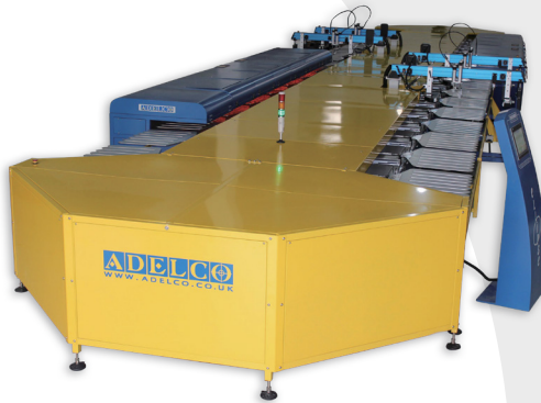
Bespoke oval design auto sock printer illustrated