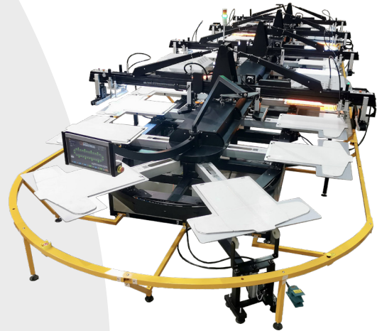
All Over Oval Printing Press Prints on every part of the shirt.

"I would recommend any of the Adelco products to anyone, not only for the quality, but definitely for the support offered after the sale."