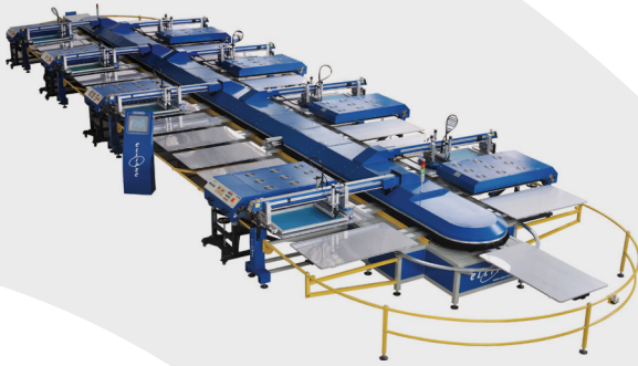
Model No: OPP-8C36S-80120 8 colour - 36 Station 80x120cm Printing Area