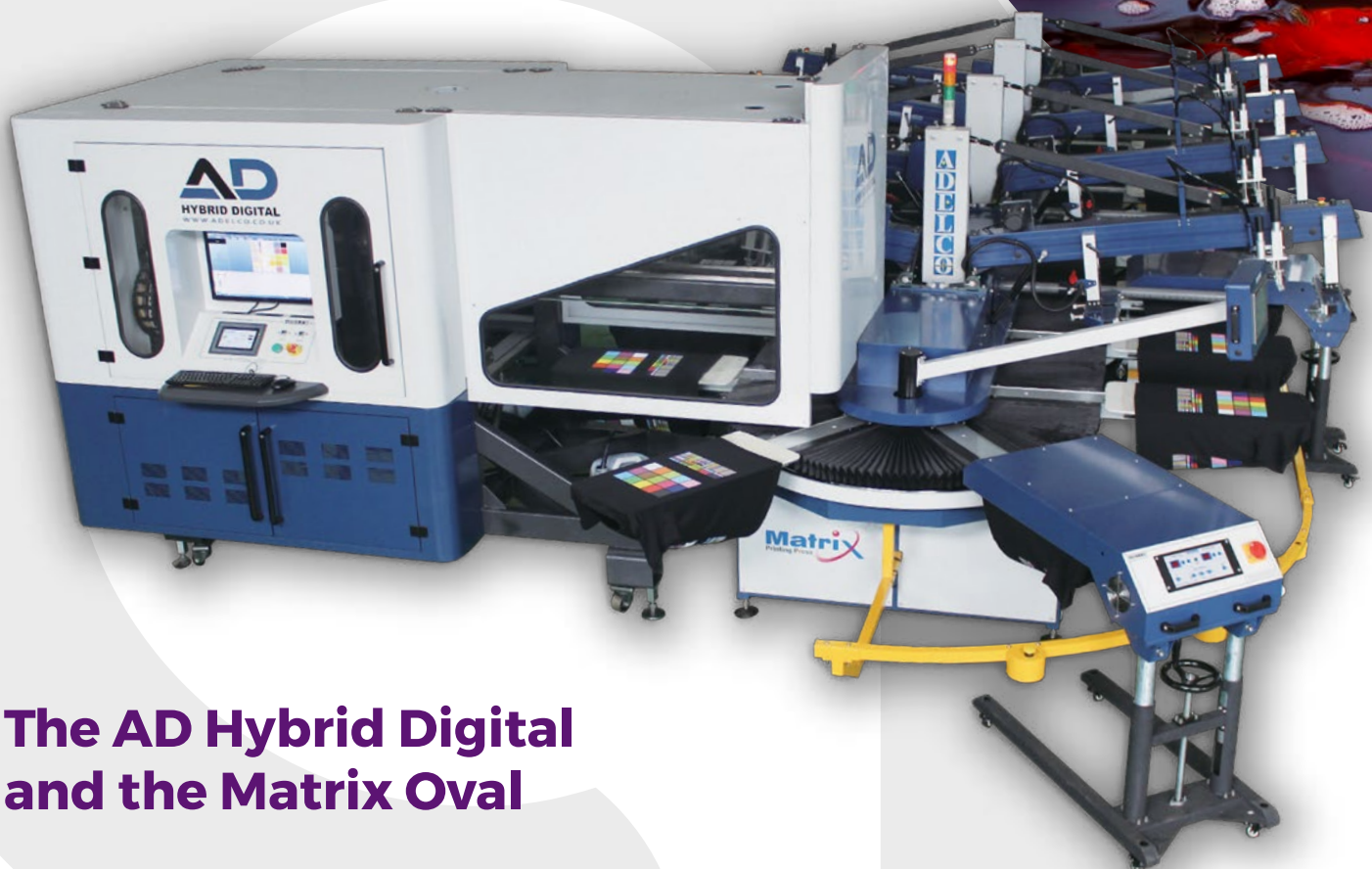
The AD Hybrid Digital and the Matrix Oval