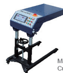
Many Flash Cure Options