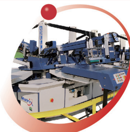
Flash cures fit in any position including under print heads

Larger models available up to 66 stations