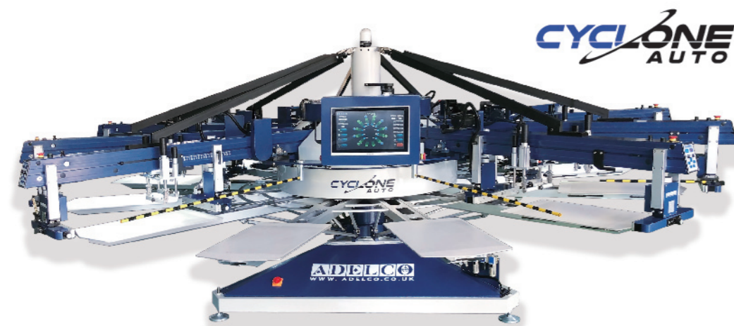
NEW CAROUSEL PRINTER FROM ADELCO