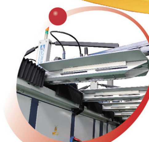
Ultra rigid pallet arms

Available in three standard print size formats. The Matrix can be configured for almost any production requirement with an almost infinite No of pallets & print stations.