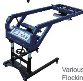
Various Flocking Options