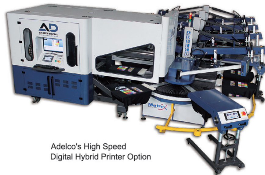
Adelco's High Speed Digital Hybrid Printer Option

The Matrix has a Unique Rail and drive system quality that ensures almost Silent operation creating a Quiet print shop environment.